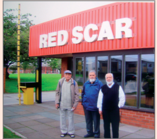
▲ Some of the people who worked at Courtaulds